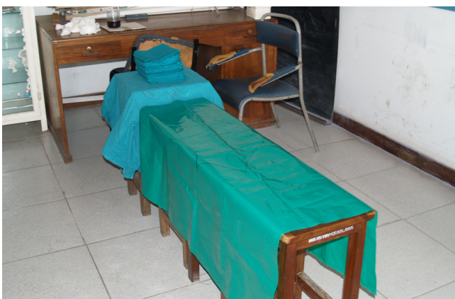
Figure 2 Picture of bench draped with polythene sheet for a patient preparation station.

The intubation station was carried out using adult intubation mannequins ("Airway Larry," Nasco Health Care) and adult laryngoscopes. The chest model used to teach chest tube insertion consisted of a teaching-skeleton rib cage draped with layers of foam and opaque vinyl that were sewn shut (Figure 4). Students were to review anatomy on a volunteer male student, isolating the fifth rib on